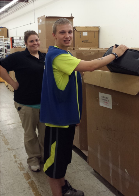
Austin at Goodwill—Sterling